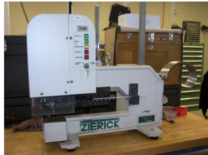
A machine developed by Zierick to install the components they manufacture.